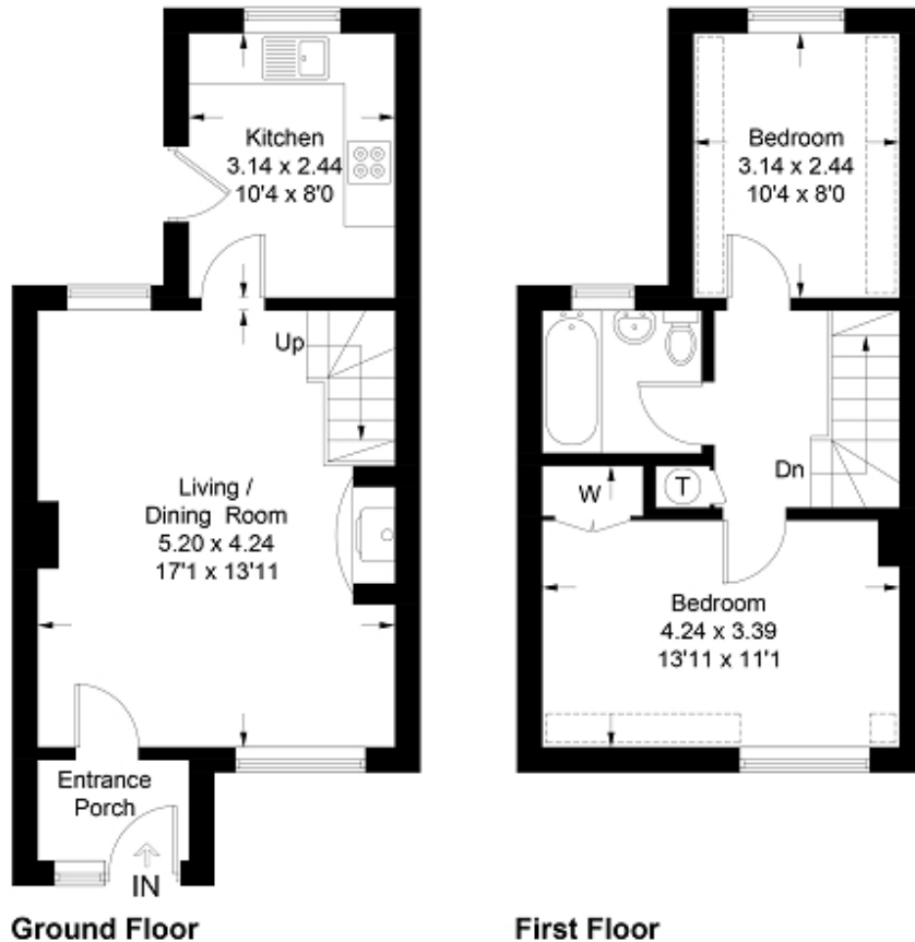
Illustration for identification purposes only, measurements are approximate, not to scale. Fourlabs.co © (ID1225726)